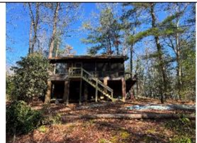
12 Former Cabin Blue Ridge GA