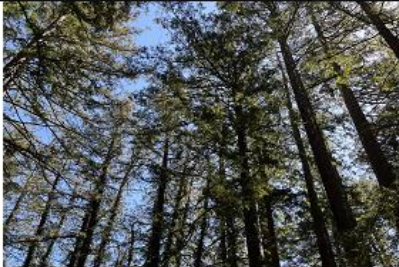
04 Redwoods Oakland California