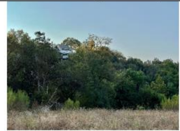
09 Former home Georgetown TX