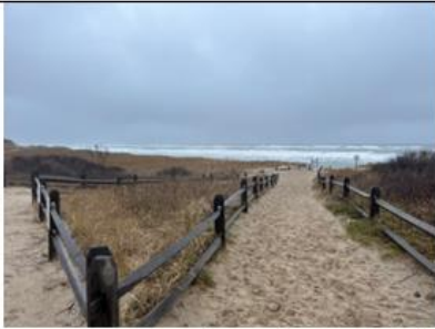
01 Coast Guard Beach Cape Cod