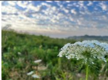
07 Fort Hill Eastham MA