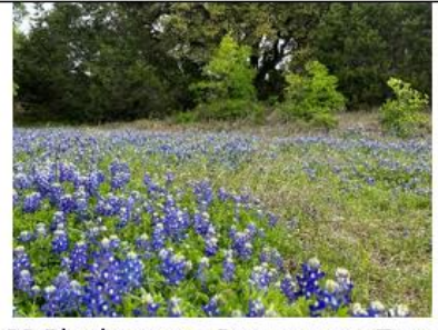
03 Bluebonnets Georgetown Texas