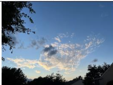
10 Sun City Texas Neighborhood