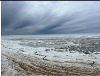
02 Ice on Cape Cod Bay