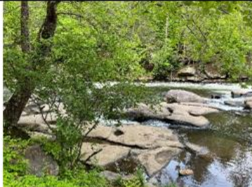
05 Party Rock Blue Ridge GA