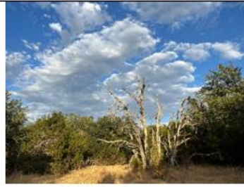
08 Sun City Georgetown Texas