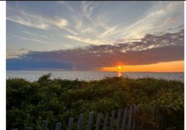
06 Sunset Cape Cod Bay